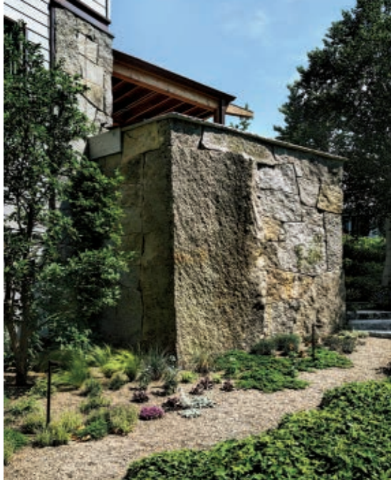
A GRAVEL PATH meets stone steps (ABOVE) that lead to the loggia, where the roof extends to protect the entrance (RIGHT) to the building. To the right of the front door more copper detailing adds interest.